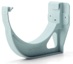
MOULDED FITTINGS Support Bracket