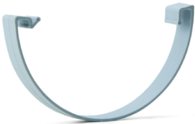
MOULDED FITTINGS Clamp