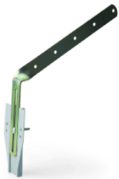
MOULDED FITTINGS Side Bracket