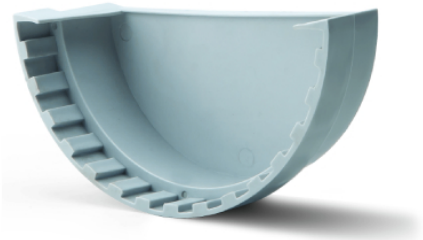
MOULDED FITTINGS Short Stop End