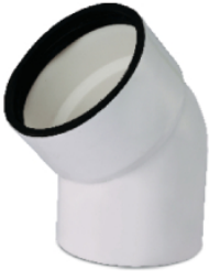
MOULDED FITTINGS Single Socket Elbow