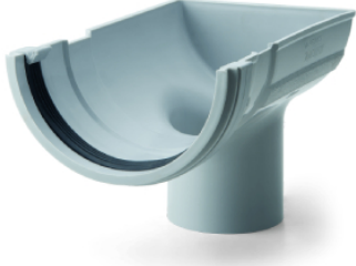
MOULDED FITTINGS Stop End Outlet (With 1 Clamp)